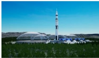
External View of Expo

The careers education charity 4wardFutures are hosting a Virtual World Space Week Careers Expo from the 4 th to 10 th October 2021 .