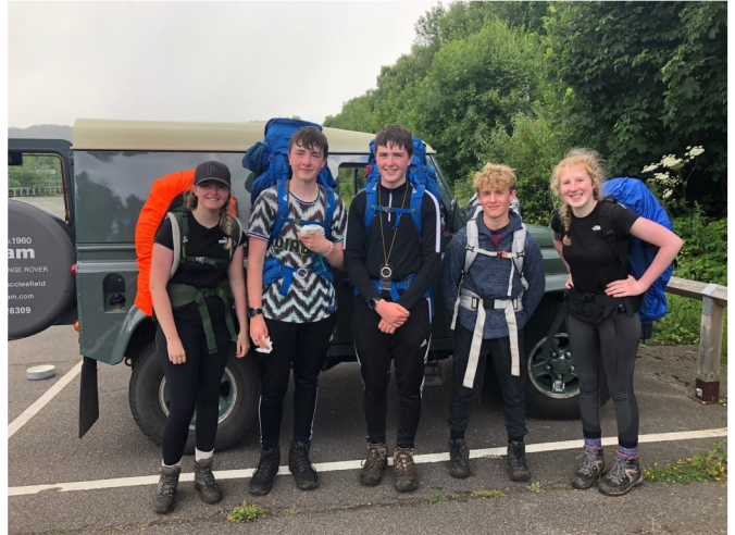
Very wet staff at the end of the Expedition!