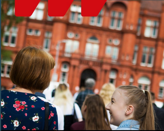
// Peel Park